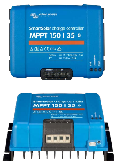
SmartSolar Charge Controller MPPT 150/35